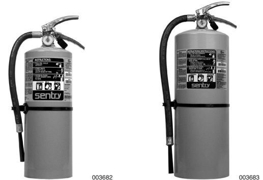
SENTRY 10 LB EXTINGUISHER